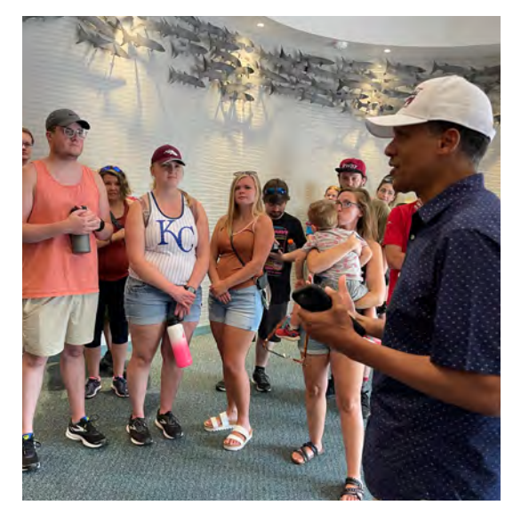
AUGUST 2022 Opening Session