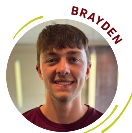
Hometown: Winterset, IA Major: Elementary Education