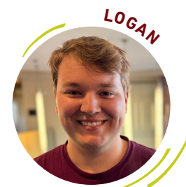
Hometown: Le Mars, IA Major: Music Education