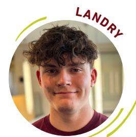
Hometown: Sergeant Bluff, IA Major: Business Administration