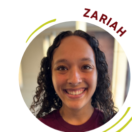
Hometown: Cedar Falls, IA Major: Biopsychology & Criminal Justice