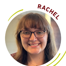
Hometown: Sioux Falls, SD Major: Biology & Chemistry