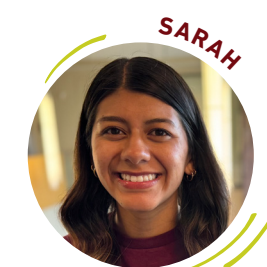
Hometown: Larchwood, IA Major: Developmental Psychology