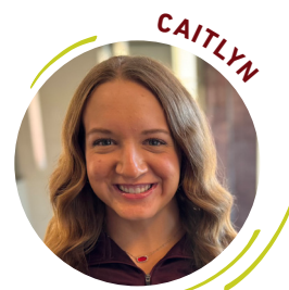
Hometown: Remsen, IA Major: Counseling & Developmental Psychology