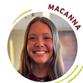
Hometown: Logan, IA Major: Biology