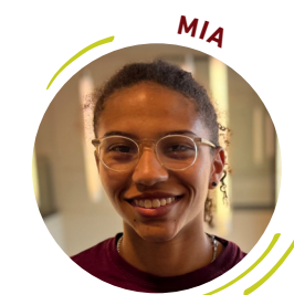
Hometown: Luverne, MN Major: Counseling & Developmental Psychology