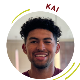
Hometown: Pasadena, CA Major: Finance