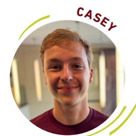
Hometown: Papillion, NE Major: Marketing