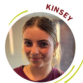
Hometown: Redfield, IA Major: Pre-Med & Psychology