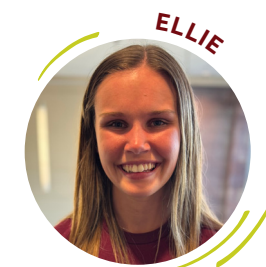
Hometown: Boyden, IA Major: Elementary Education