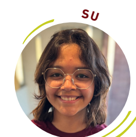
Hometown: Lincoln, NE Major: Art Education