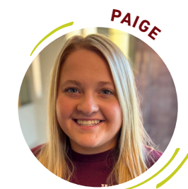
Hometown: Meriden, IA Major: Applied Ag & Food Studies