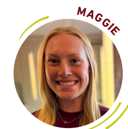
Hometown: Ankeny, IA Major: Nursing