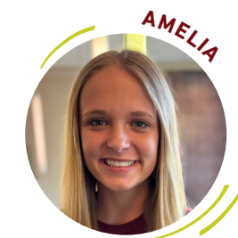
Hometown: Logan, IA Major: Elementary Education

The University Engagement team oversees Orientation. They work with a group of students called the Welcome & Orientation Organizers (WOO) Crew who will serve as your Orientation gurus. The members of the WOO Crew will get you to where you need to be, answer questions, lead activities, and spend time getting to know you and helping you feel at home.