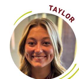
Hometown: Clarinda, IA Major: Corporate Communications