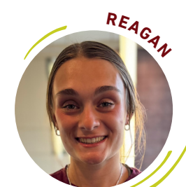
Hometown: Sioux City, IA Major: Nursing