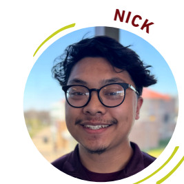
Hometown: Sioux Falls, SD Major: Biology