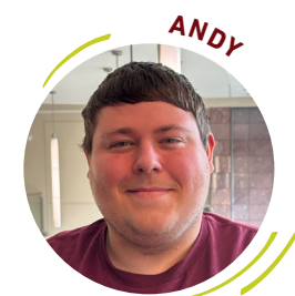
Hometown: Sioux City, IA Major: Elementary & Special Education