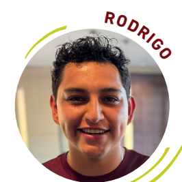
Hometown: El Salvador Major: Business Administration & Religious Studies