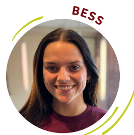
Hometown: Prairie City, IA Major: Developmental Psychology & Religious Studies