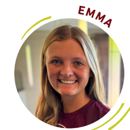
Hometown: Sheldon, Iowa Major: Elementary Education